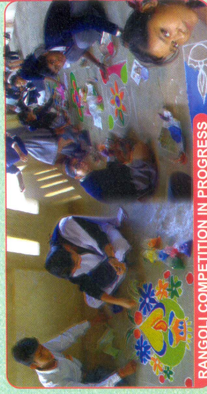
RANGOLI COMPETITION IN PROGRESS